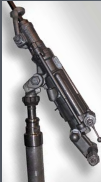
Pneumatic Rock Drills